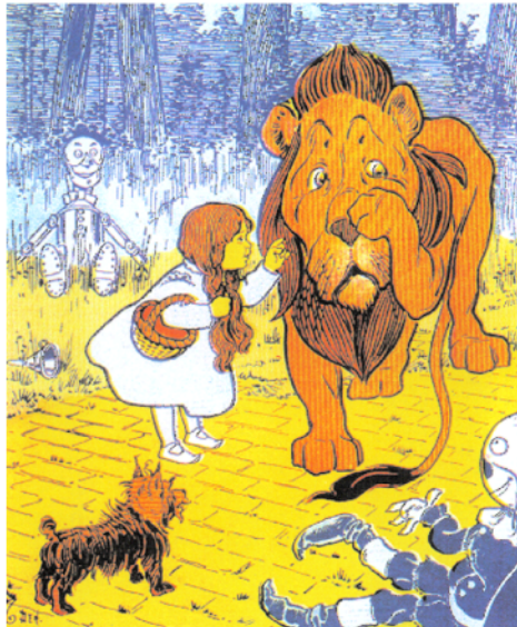
The Formal Theory translates the dialogue between the characters into an ongoing predictable, personal dialectic.

The only difference between the unconscious mind and of the pendulum motion is that the mind interrupts this cyclic repetition of events by seeking conflict resolution and rest. Unlike the pendulum going back and forth forever, Dorothy and her friends walk the Yellow Brick Road twice to confront and conquer mankind's fears by transforming conflict to resolution, or in formal terms, by transforming passivity to activity, antagonism to cooperation and alienation to mutual respect.